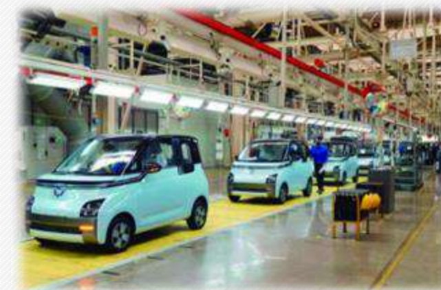
WULING Factory in Indonesia