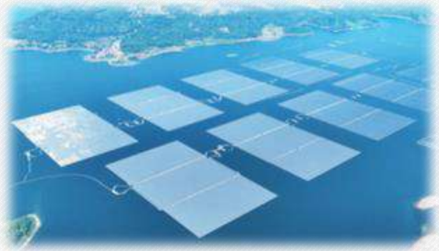
Cirata Floating Solar Power Plant