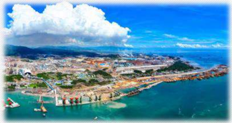
Morowali Industrial Park