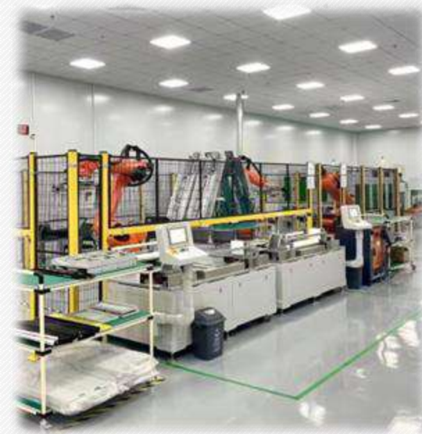
Automatic Lithium Battery Production Line

Integrated industrial/supply chain, approach to sustainability, dives Indonesia as a leader