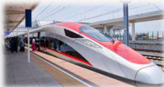
Jakarta-Bandung high-speed railway