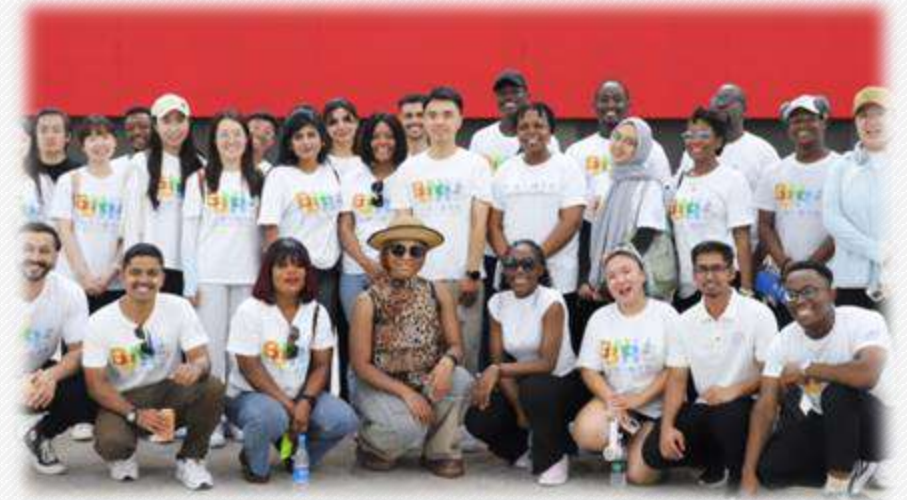
BRI school students in Social practice activities