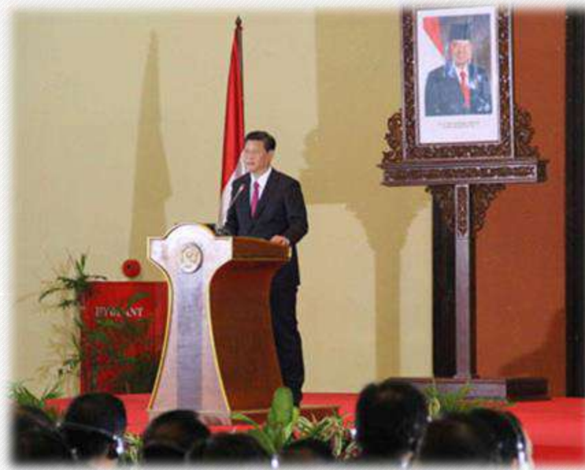
21 st Century Silk Road proposed by President Xi, Indonesia, 2013